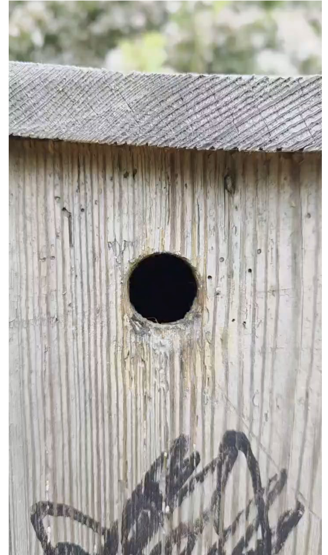
Baby Blue Tits in the Community Garden at Coulsdon South