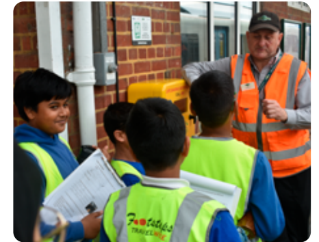
↑ Southern station staff help children navigate station safely.