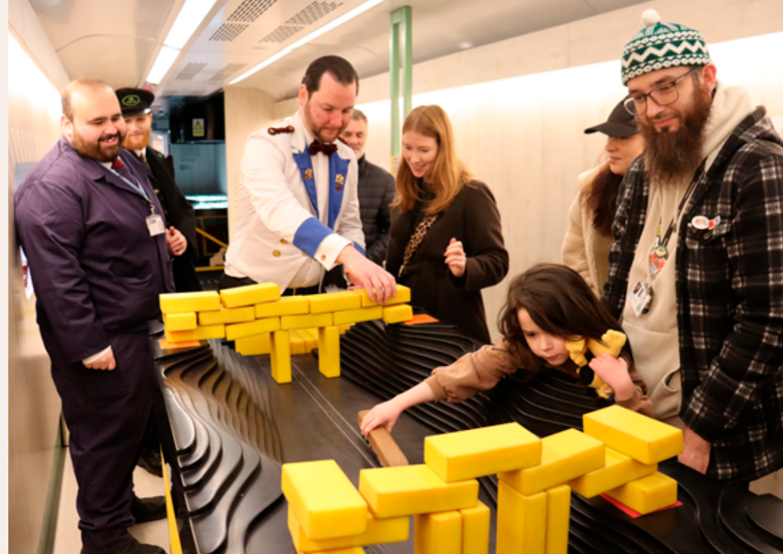
Inspiration exhibition train visited by Hastings & Rye MP Helena Dollimore

Four of the 100 modern jobs displayed on our blue plaques, highlighting some of the many and varied jobs that exist on the modern railway. For the full list, and more details of these jobs, please scan the QR code on p111