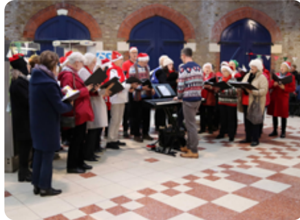
↑ Windsor Soundswell Choir

Reading stations Family Fun Day in Brunel Arcade, featured activities including games, a swap shop, quizzes, badge making and art workshops. The British Transport Police provided their wonderful mobile mini railway safety exhibit and Reading Buses had games and prizes.