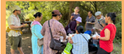
Try a Train trip to Chilworth Gunpowder Mills.

More details: southeastcrp.org/case-studies/try-a-train-trip-with-the-nepalese-association-and-surrey-hills-national-landscape-and-surrey-hills-society/