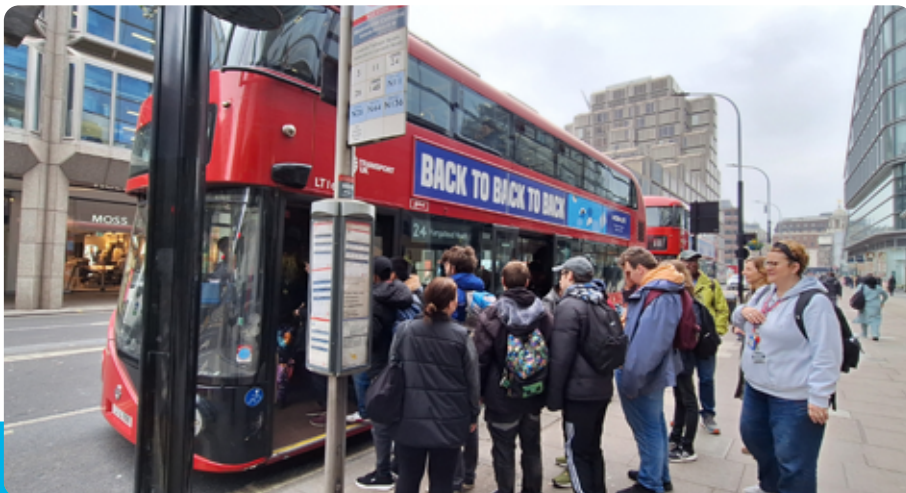
↓ Travel with Confidence takes to the buses.

At the start of the project, the challenge was set to see how many different types of public transport could be used. So far, travel has taken place on train, bus, tube, tram, monorail (at Gatwick Airport), ferry and hovercraft!