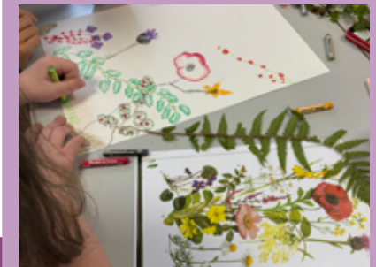
Workshop at All Saints Primary School, Wokingham.

It was a great and enjoyable creative experience for the children. The school benefited from a large amount of art materials for future use and the wonderful artworks, themed around hidden wildlife have enhanced Earley Station enormously for all to enjoy. Local families were delighted to see their children's work on display, fostering a sense of community.