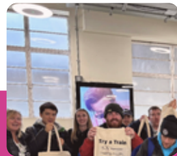
↑ Butterfly project Try the Train at Horsham 2025.