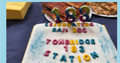
Staff, partners and passengers celebrate Tonbridge stations 183rd Birthday.

More details: southeastcrp.org/case-studies/community-rail-week-plus-rail-200-event/