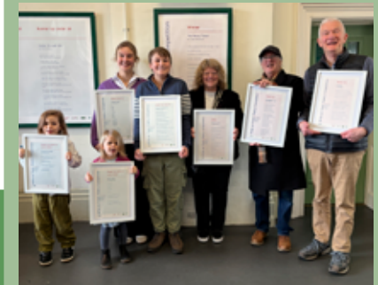
Winners of the Write on Track poetry competition with their Railway 200-themed verses at Rye station.

The group also organised a Railway 200-related poetry competition called Write on Track with the winning poems displayed at Rye station. Funding for both projects came from a Railway 200 grant from Southern Railway.