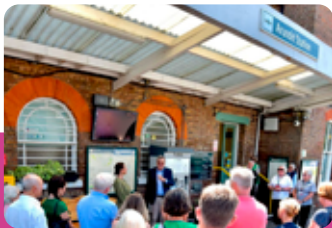
↑ Unveiling of the plaque designed for the Armed Forces & Veterans Breakfast Clubs (AFVBC) at Crawley by Lady Emma Barnard, Their Majesties’ Lord Lieutenant of West Sussex.

As part of the Bognor Regis Town Christmas lights switch on, a piano was temporarily situated on the concourse, with a programme of live music leading up to and just after the big lights switch on. This was a new initiative between Southern Railway, the SCRCP and the Track at Bognor Station.