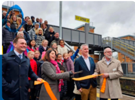
↑ Barnes mural. The opening.

The Mayor of Richmond, local councillors and station staff sang 'Happy Birthday' to passengers as they passed through the ticket hall.