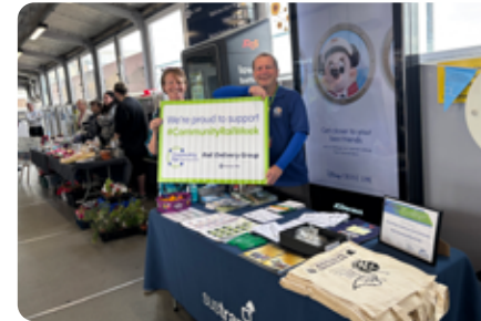
↑ Staff and students From the Oaks host their May Fair on the bridge at Tonbridge station.