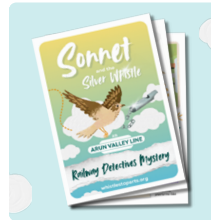
↑ AVL Activity Pack Mock Up.

the project’s reach to schools, families and community groups, encouraging exploration, learning and sustainable travel.