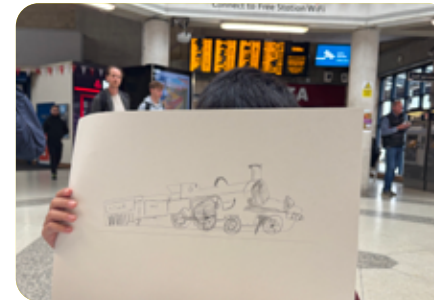
↑ Fantastic drawing of a train by a young participant The Big Draw Festival 2025.