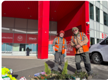
↑ Kew Bridge Bee Friendly Trust with plants.