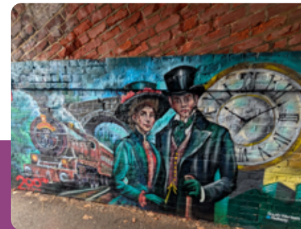
↑ Winnersh Triangle mural