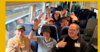
Above: Friary Gardeners volunteers on the train to Robertsbridge for annual trip Left: Friary Gardeners with their planters on Robertsbridge station platform.

More details: southeastcrp.org/case-studies/friary-gardeners-annual-visit-to-robertsbridge/