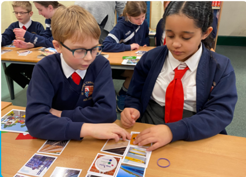
↑ Primary school children learning with Go Learn.