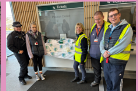
Taking part in the ‘Your Community Cares’ local initiative for White Ribbon Day, November 2025.

More details: southeastcrp.org/case-studies/operation-parkside-collaborative-safeguarding-assessment/