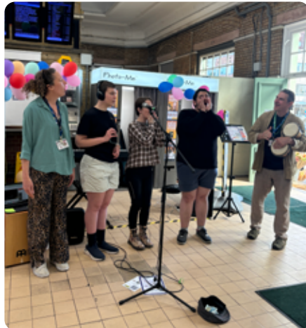
↑ Supajam College Students Busking at Hove.

explore attitudes to rail safety. Young people designed and delivered a peer-led survey, analysed the findings and presented recommendations to rail professionals. The project strengthened students’ understanding of railway operations while developing research, teamwork and presentation skills.