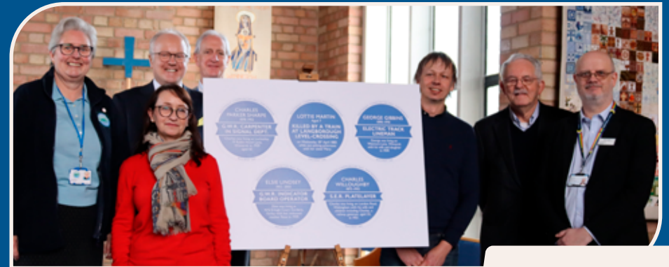
Our first Railway 200 event, Winnersh 10th January 2025

Much of our activity was Railway 200 themed, and we particularly focused on our 200 blue plaques, our showcase event on 1st August (1.8.25!) and the visit to several of 'our' stations of the exhibition train Inspiration.