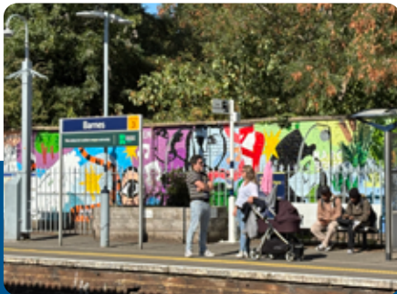
↑ Barnes mural with chatting.