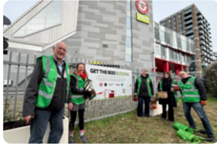
↑ Kew Bridge BFC volunteers.

St Margarets Station celebrated its birthday party with tea and cakes served by volunteers from the station adoption group.