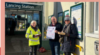
Volunteers give out White Hearts at Lancing Station.

The “Your Community Cares” campaign, led by SCRP with West Sussex County Council, GTR, and the Library Service, promoted kindness and awareness around violence against women and girls. Timed with White Ribbon Day, it invited residents to knit white hearts, symbolising care and solidarity. Over 7,500 hearts were donated and distributed at 20 stations with support cards linking to help services. The initiative gently raised awareness while fostering community connection, engaging partners and passengers, sparking conversations and leaving a lasting message of compassion and support. Feedback was positive, highlighting hope, inclusivity, and meaningful impact.