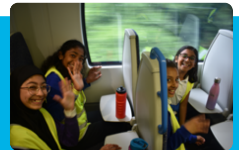
↓ A group of students on the Go Train travel part of their workshop.