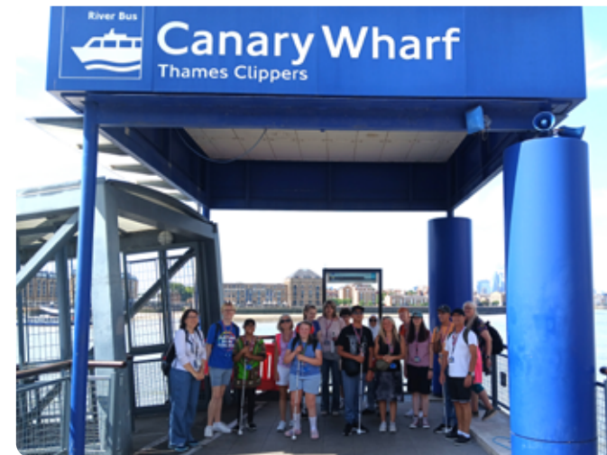
← A ferry ride for the Travel with Confidence trip to Lonon.