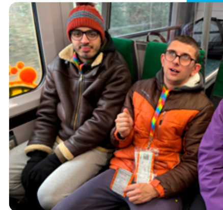
↑ On board a tram, Halow Students on their Travel with Confidence trip.