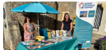
← One You and Sussex Outreach Service Health and Wellbeing drop-in sessions.

More details: southeastcrp.org/case-studies/friary-gardeners-annual-visit-to-robertsbridge/