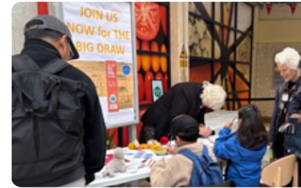
↑ Volunteers at Guildford Station helping with the Big Draw Festival 2025.

“Thank you for a really enjoyable day, it was a unique experience which helped improve knowledge, understanding and confidence.”