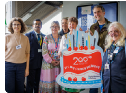
↑ St Margarets mayor cake and group.