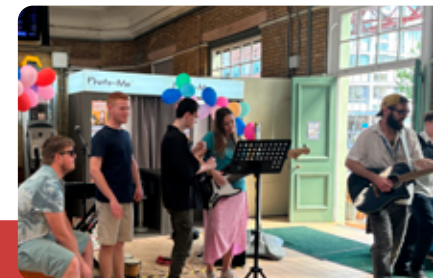
↑ SupaJam college busking at Hove station.