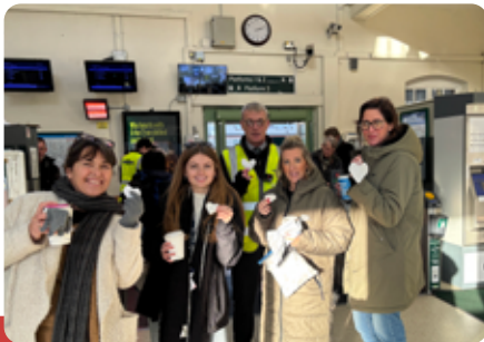
↑ Volunteers at Worthing on White Ribbon Day.

During BHASVIC College’s Skills Week, Sussex Coast and Sussex Downs Line Officers worked together along with students to