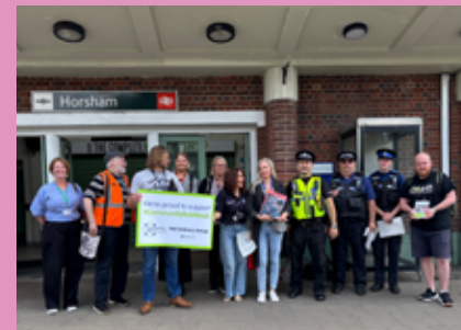
Operation Parkside Assessment day begins at Horsham Railway Station, May 2025.

“Working closely with SCRCP and its line officers over the past two years has been a genuinely positive experience. Through this collaboration, we have been able to deliver meaningful rail-based projects and build strong partnerships across the sector that are making a real difference to local communities”