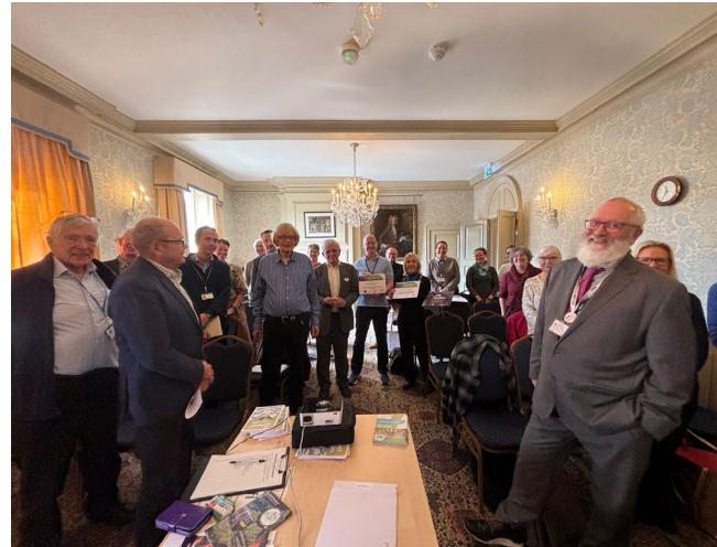
Sussex Coast, Arun Valley & Sussex Downs Lines Steering Groups celebrate our awards