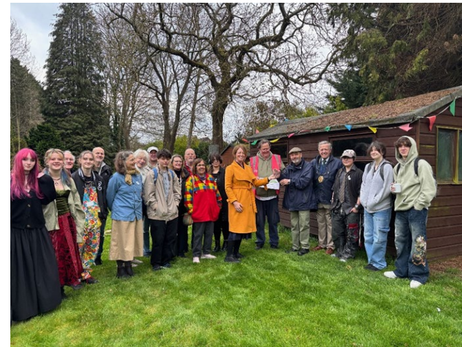
Farnborough Street Residents Association with their award