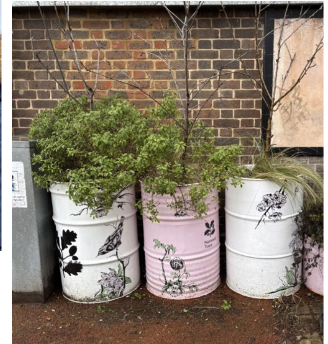
Planters at Hounslow Bus Station