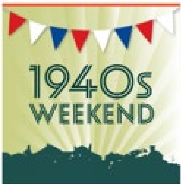
Steam into the 40s