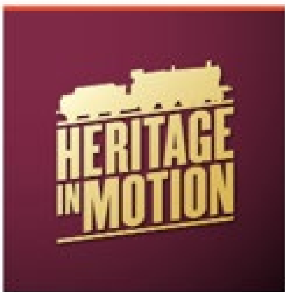
Heritage in Motion -