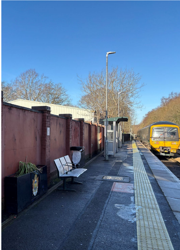
Platform 2 at Farnborough North; work in progress for the new murals by Farnborough 6 th Form College

A chilly start to the New Year with blue skies and sunshine at Farnborough North Station where I was measuring the spaces for the new artwork by students at Farnborough 6 th Form College. Meanwhile, here is a sneak preview of one of the 5 panels.