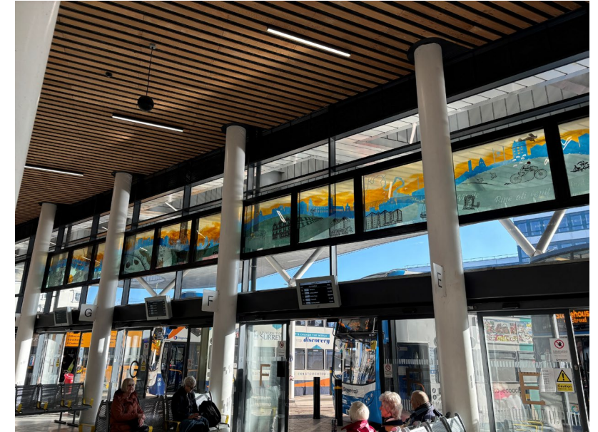
Artwork on the windows at Gloucester Transport Hub

Attended the EEH Women and Girl's Safety on Public Transport Conference online. Attended the GWR catch up for CRPs in Gloucester in person; although Storm Bert stopped many from attending. Had a SCRPs policies workshop in Lewes which encouraged useful discussion. Railway 200 working meeting. Looking forward to the Winter Warmer event in Guildford next week.