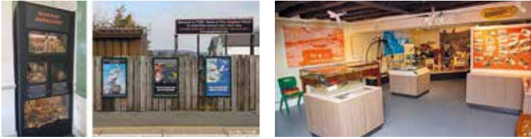
ABOVE: Ford station ABOVE RIGHT: Crawley Museum