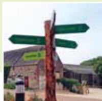
ABOVE: Southease YHA BOTTOM: Cycling on the Egrets Way. OPPOSITE: The Seven Sisters Country Park