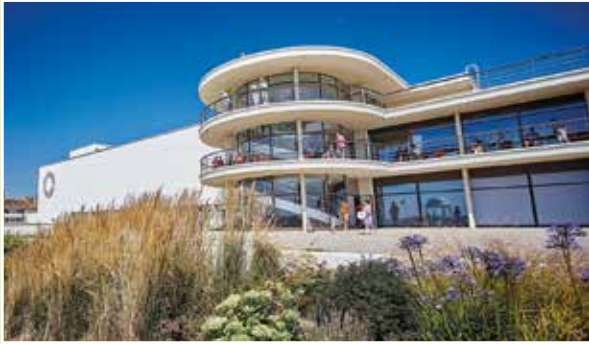
The High Weald