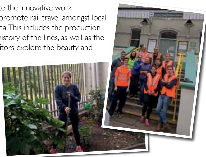
SDNPA & SCRP Promoting Rail Travel at Eastbourne

The County Council also appreciate the innovative work undertaken by the Partnership to promote rail travel amongst local communities and visitors to the area. This includes the production of line guides, events to mark the history of the lines, as well as the regular hosting of walks to help visitors explore the beauty and character of West Sussex.