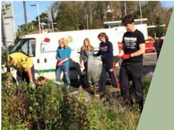
Department for Transport work party at East Grinstead

Corporate volunteering days really benefit Community Rail, as a willing team can achieve much in a few hours. Employees develop team building and communication skills, while having fun and making a real difference to a community.