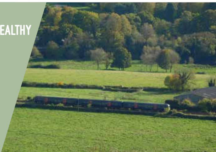
GWR train in the rolling North Downs countryside

PROMOTING HEALTHY WALKS AND SUSTAINABLE TRANSPORT