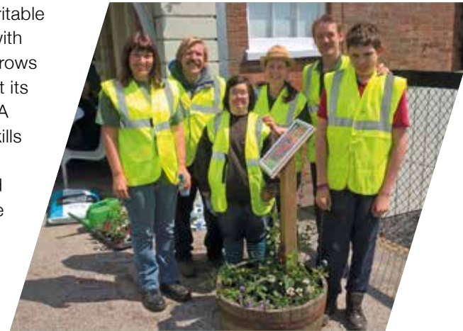
Trust volunteers with a newly planted tub at Rye

Canterbury Oast Trust is a charitable organisation for young adults with learning difficulties. The Trust grows its own plants and sells them at its base near Ham Street station. A small group showed off their skills at Ashford and Rye stations, planting flowers in the tubs and making hanging baskets for the entrance and platforms. They will now maintain the flowers as station partners.