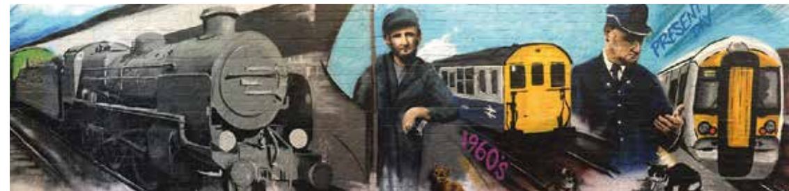
The finished underpass mural with scenes of station history