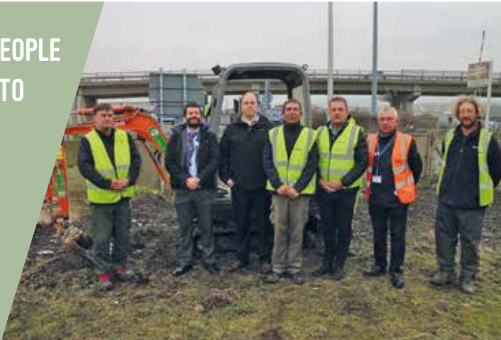
Burley's team with Southern and Newhaven Port Authority

BRINGING PEOPLE TOGETHER TO TACKLE PROBLEMS AROUND STATIONS