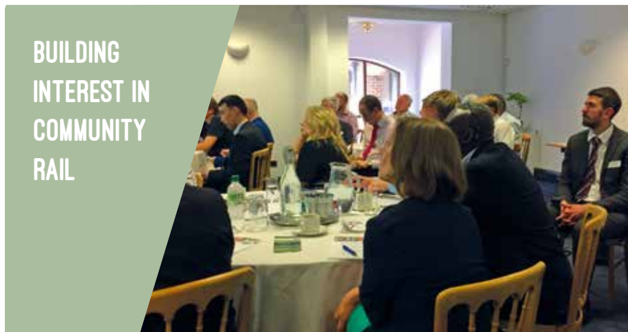
Key stakeholders at the launch of the North Downs Line in July 2017

The Partnership is pleased to have the support of Gatwick Airport Ltd, MetroBus, SCC, Guildford Borough Council, Mole Valley District Council, Surrey University, Royal Surrey Hospital, Surrey Hills Area of Outstanding Natural Beauty, North Downs Way, and parish councils along the line. In 2018, SCRCP will work with GWR and South Western Railway to extend the new CRP as far as Reading.