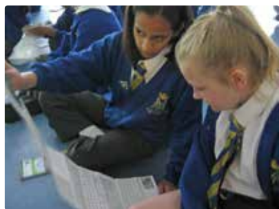
Learning to read a timetable

This year, World War II evacuation train rides for three schools added an extra dimension to the station visits, actively contributing to the delivery of the school curriculum.