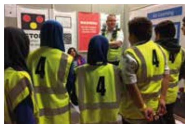
Rail Enforcement Officers give safety talk at Crawley Junior Citizen event

At the indoor Safety in Action and Junior Citizen events, Southern's Rail Enforcement Officers deliver Rail Safety sessions using a floor mat depicting the layout of the platform and tracks at a station.