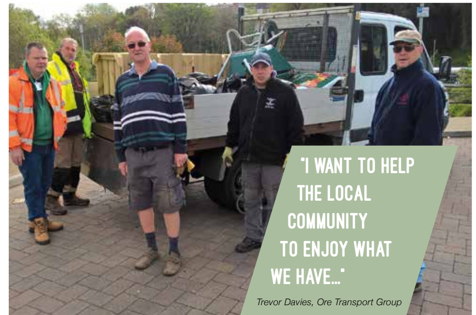
Trevor and Friary Gardeners volunteers ready for a day's digging

Local businesses have offered help and funding, and in Spring 2018, a Network Rail work party will build raised beds using old sleepers.