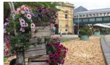
Lewes station garden with summer planting

Our website and our popular range of Line Guides will be updated and relaunched; station travel plans will be developed; the Rail Education Officers will reach even more people and our Line Officers, working with our station partners and volunteers, will deliver even more improvements for communities.