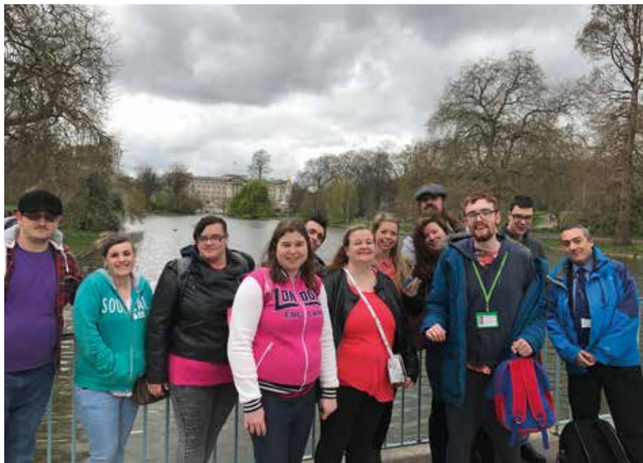
County Care group visit Buckingham Palace

County Care helped to develop Southern's Communication Guide and Travel Support Cards for people with disabilities, giving Southern invaluable feedback on issues that present a barrier to independent travel.