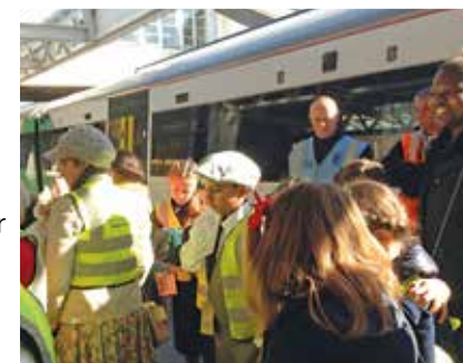
Arunside Primary on WW2 evacuation train trip

Numbers participating in Go Learn are increasing year on year. In the 9 months from April-December 2017, over 5,400 children received Safety in Action or Junior Citizen training; over 700 children had classroom workshops; and 11 station visits were carried out with 339 children. The total number of children receiving the training was 6,472, already up 13% on the year from April 2016-March 2017.