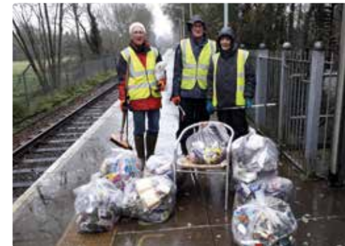
Brighton Uckfield volunteers cleared rubbish including a garden chair