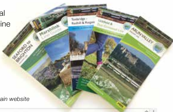
Brighton-Seaford line features in Scenic Rail Britain website

No chance was lost to promote local destinations through our individual line guides and over 10,000 were distributed through a range of SCRP events and partner outlets.