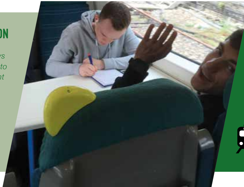
Completing the ITTT workbook on the train

In October, SCRCP carried out classroom workshops on travelling independently. Then a group visited Hampden Park and Brighton putting theory into practice with a surprise visit to The Brighton Toy and Model Museum.