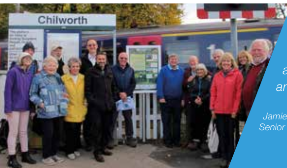
Unveiling the North Downs Way sign at Chilworth station

"We value the excellent work that SCRP undertakes in promoting rail travel amongst the local community and to visitors."