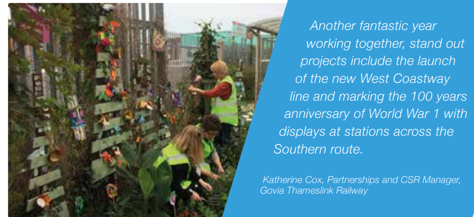
Angmering Station partners Sidetracked were nominated for the 2018 ACoRP Awards

The Station Management Team are also very supportive. At Hove station, staff decorated their Christmas tree with hand-knitted baubles which commuters could take home for a small donation to Chestnut Tree House Children's Hospice. 2019 projects will include murals to brighten up station underpasses.