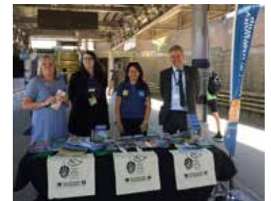
SCRPs joins Kent CRP and Southeastern at a pop-up info event at Tonbridge station.

We have continued to work closely with SCRP to promote visits by rail to the South Downs National Park.