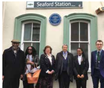
A blue plaque commemorates the British West Indies Regiment's stay at Seaford in 1915.

79% of our income derived from Train Operating Companies, reflecting our engagement with Great Western Railway as well as Govia Thameslink Railway this year. 8% came from Gatwick Airport Ltd and the balance from local authorities, businesses and other local organisations. 80% of our costs covered salaries and associated office, travel and line group costs with the balance covering communications and event costs, again reflecting our wider geographical area.