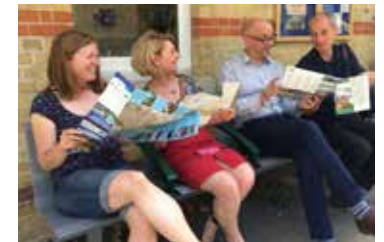
Perusing the 2018 Line Guides