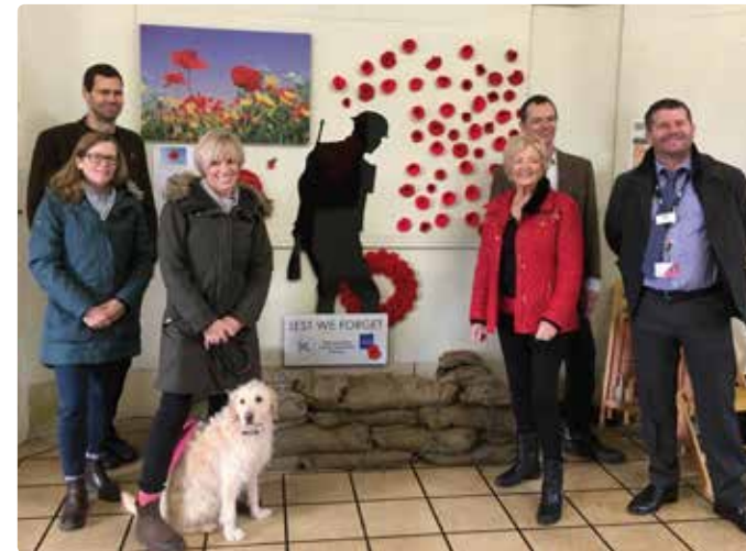
Community members gather at Bishopstone to commemorate the First World War

After a year of hard work, community volunteers, railway staff, the Railway Heritage Trust, the planning officer and support from ACoRP have started us on the road to restore this forgotten Grade II listed Art Deco station into a community hub. SCRCP built momentum, interest and engagement through a schools exhibition of pinhole photography and platform clearance days with Network Rail. The Friends of Bishopstone are now creating a plan to take this challenging project forward.