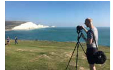
Filming the famous coastal view at Seaford Head

We held 20 roadshows during the year at stations, careers fairs, freshers' fairs, and other local community events. The highlight was Community Rail in the City at London Bridge and Waterloo stations where we engaged with around 1,000 rail passengers and even ran a "Guess the weight of the cheese" competition!