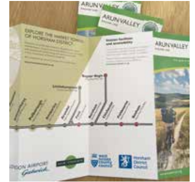
The Arun Valley line guide highlights Horsham District market towns

In May, HDC officers joined SCRIP at London Bridge Station for 'Community Rail in the City' handing out literature to visitors and commuters. SCRIP and the Arun Valley Line Group look forward to exciting collaborations in 2019, HDC's Year of Culture.