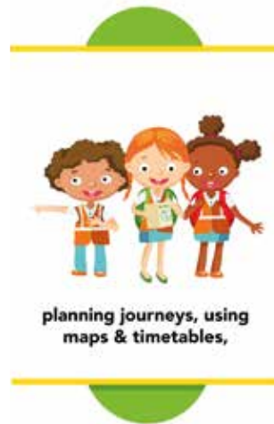
Southern promoted Go Learn on Facebook with this cartoon