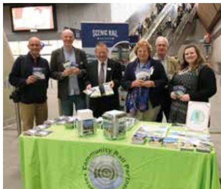
Community Rail in the City at London Bridge.

SCRCP's increased size and turnover has led the Board to strengthen our fundraising and finance capability by appointing a specialist officer and introducing an on-line personnel and financial system. This will equip us for the future and deliver statutory and management information requirements. We also aim to diversify our income by attracting alternative grant funding.