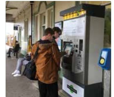
Trying out the ticket machine at Seaford station

SCRCP has developed new school workshop materials including an ITTT work booklet based on a BTEC qualification in Skills for Independence and Work (Using Public Transport). The training is supported through Southern's 'Try a Train' scheme which provides a free accompanied train trip to disadvantaged groups. The partnership between SCRCP, AAfG partners and Southern has been very successful and we look forward to building on this in future project proposals.