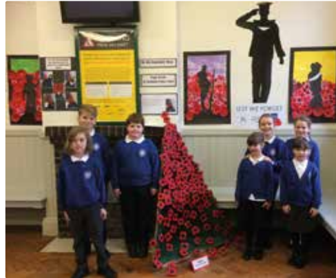
Funtington Primary children's poppy display at Bosham station

During November, many station partners created displays, exhibitions and held events as part of the nationwide Remembrance initiative. 'Silent Soldier' silhouettes of First World War soldiers, airmen, nurses and suffragettes, made by the Royal British Legion and kindly provided by Southern, appeared at stations along the Lines.